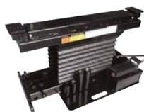
7,000 lbs. Rolling Bridge Jacks